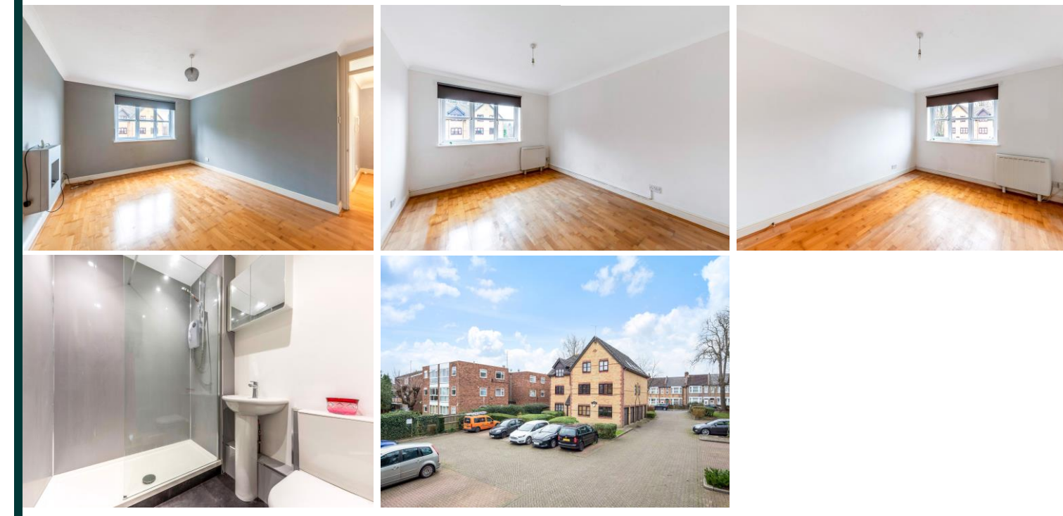
Mayfield Court, DA14 Approximate Gross Internal Area = 44 sq m / 469 sq ft

COUNCIL TAX BAND: TBC LEASE TERM: 96 Years